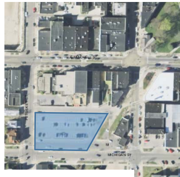
Emmet County data