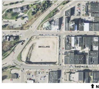
Emmet County data